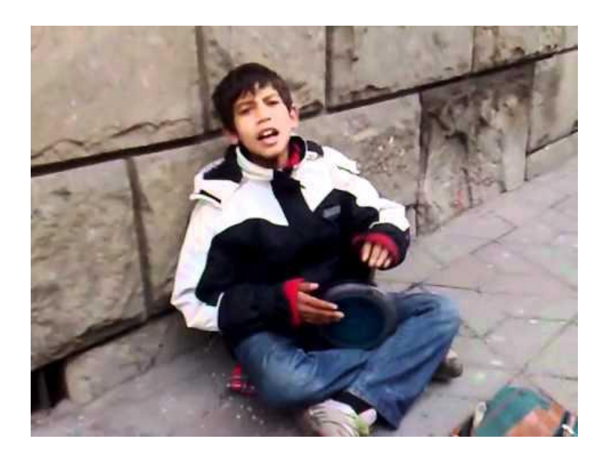
If it bothers your father