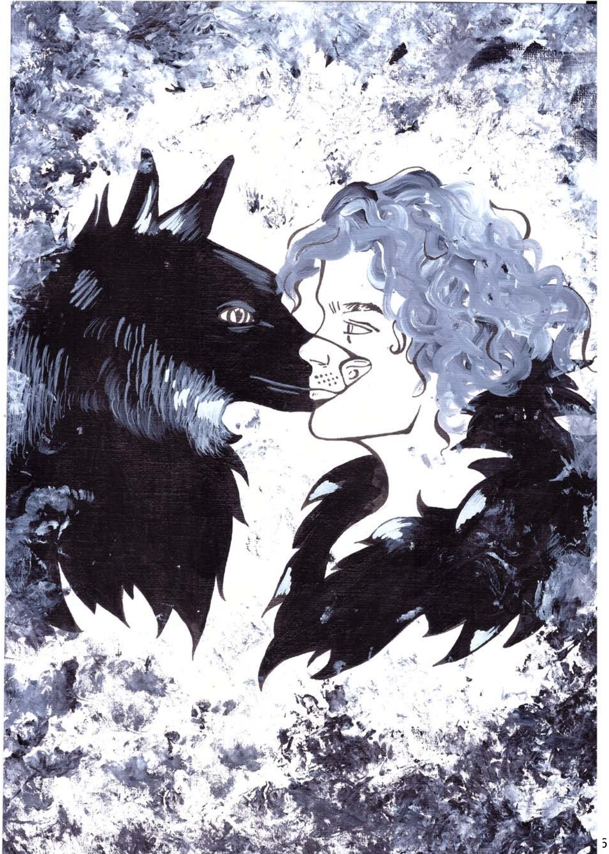
A game of unrones